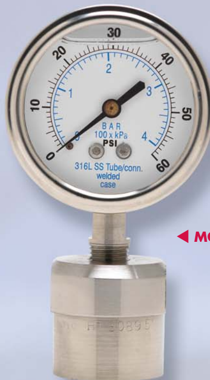
◀ MODEL DM-45